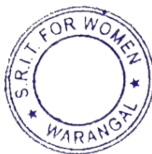
Head of the Department