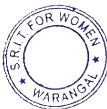
Head of the Department