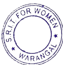
Head of the Department